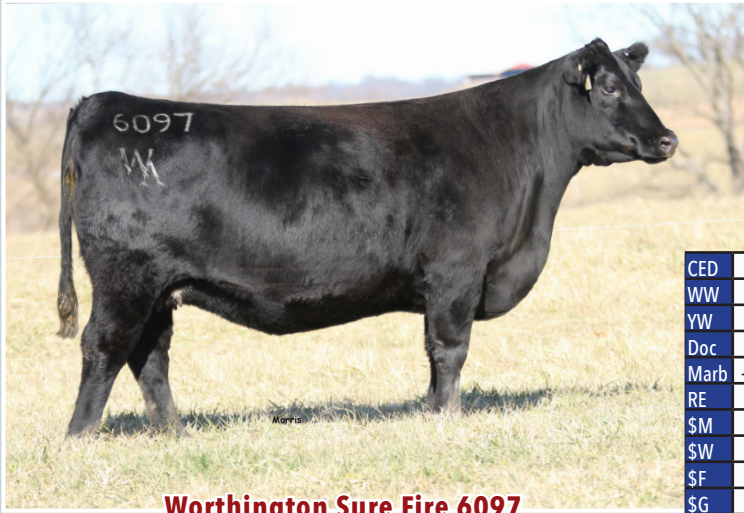
Worthington Sure Fire 6097

7TH ANNUAL PRODUCTION SALE Saturday 12 Noon at the farm in Dadeville, MO