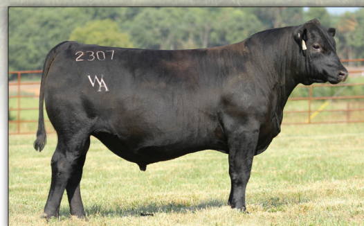
Worthington Powerplant 2307 - Dam is a full sister to Beal Breakthrough.

CED 7 WW 94 YW 165 Milk 21 Marb 1.00 RE 1.23 $B 206 $C 335