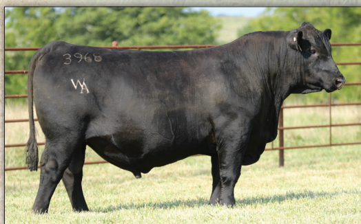
Worthington Combined 3968 - Big ribbed, powerfully constructed, outcross herd sire.

CED 7 WW 94 YW 165 Milk 21 Marb 1.00 RE 1.23 $B 206 $C 335