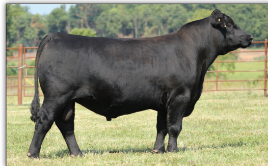
Worthington Radiant 3954 - One of 25 bulls in the breed with this level of calving ease, growth and carcass.

CED 12 WW 86 YW 150 Milk 19 Marb 1.02 RE 1.53 $B 216 $C 354