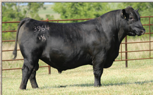
Worthington Freedom 3964 - One of the top RE EPD bulls in the breed.

CED 8 WW 83 YW 146 Milk 33 Marb 2.24 RE 1.00 $B 244 $C 381